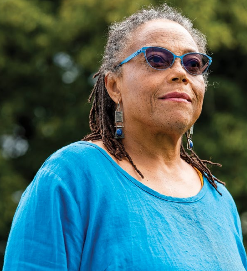
CECE, living with hATTR amyloidosis